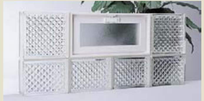
DELPHI® Pattern, with prismatic diamond design, provides moderate light transmission with maximum privacy.