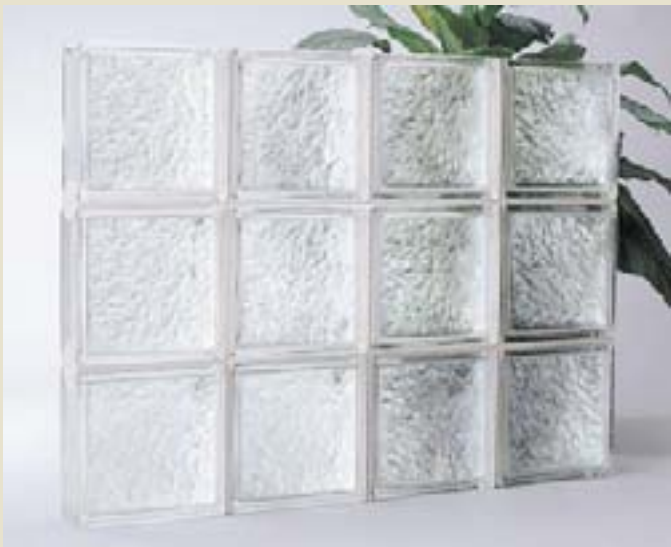
IceScapes® Non-Directional Pattern lets light in without sacrificing privacy. Maximum light transmission with a maximum degree of privacy.