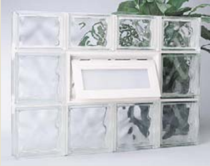
DECORA® Pattern, with its trademark wavy undulations, provides maximum light transmission with subtle visual distortion.

Choose from three distinct patterns, each offering its own unique style, degree of light transmission and privacy. Perfect for replacement or new-window and small-partition applications. Prefabricated panels are available with or without vents.